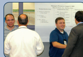
FLMs and Academy students meet and greet